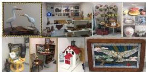
Downtown Fort Myers River District

Welcome to the RDA Ma Peggy's Emporium, LLC.